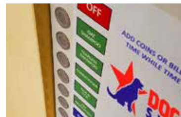
10 BUTTON OPERATION SYSTEM