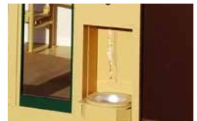
BOWSER BOWL® PET FOUNTAIN