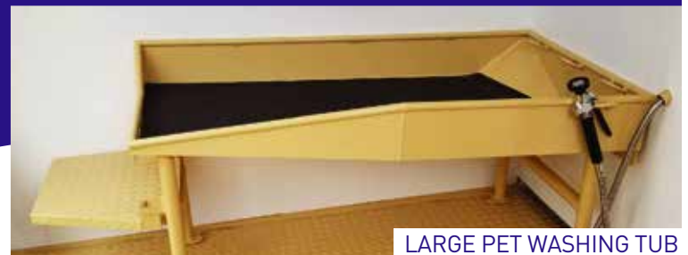
LARGE PET WASHING TUB