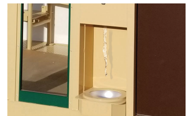
BOWSER BOWL® PET FOUNTAIN