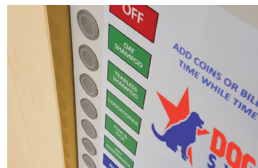
10 BUTTON OPERATION SYSTEM