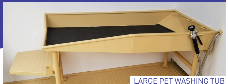
LARGE PET WASHING TUB