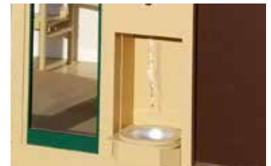
BOWSER BOWL® PET FOUNTAIN