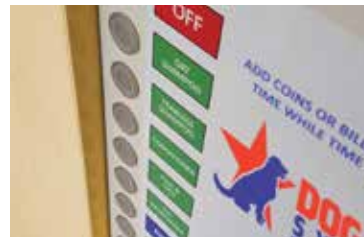
10 BUTTON OPERATION SYSTEM