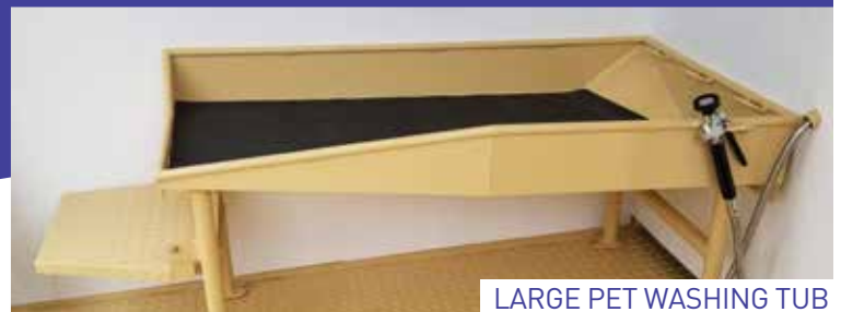
LARGE PET WASHING TUB