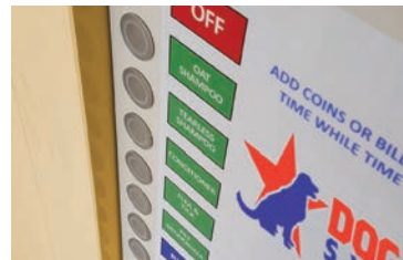
10 BUTTON OPERATION SYSTEM