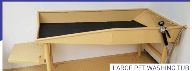
LARGE PET WASHING TUB