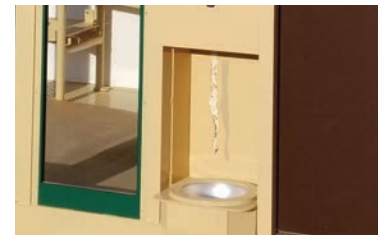
BOWSER BOWL® PET FOUNTAIN