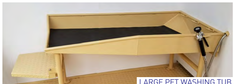
LARGE PET WASHING TUB

8642 US HWY 20 Garden Prairie Illinois 61038