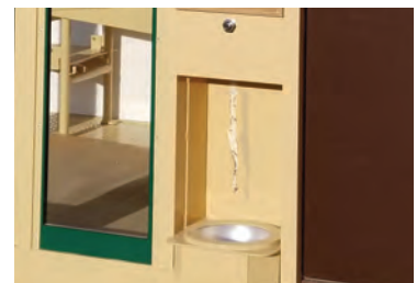
BOWSER BOWL® PET FOUNTAIN